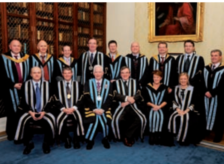
Pain Faculty Launch November 2008

Early in 2009 the faculty will be working towards recruiting ordinary fellows who have obtained the pain diploma exam, and will submit a dissertation for admission as a fellow. The faculty will also be working towards an alternative pathway to allow Pain Medicine Consultants in the UK, with Anaesthetic Fellowships from our College to gain admission to The Faculty.